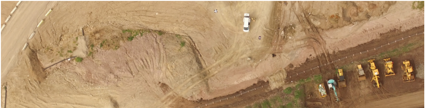
High-Definition Imagery • LiDAR Mapping • Georeferenced Orthomosaics • Georeferenced Point Clouds