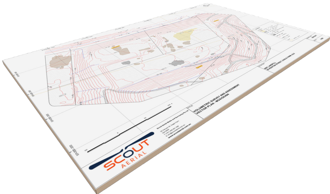
Topographic Modelling • Scale Engineering Drawings